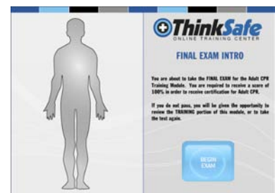
Screens from the Think Safe Online Training Center Adult CPR Course